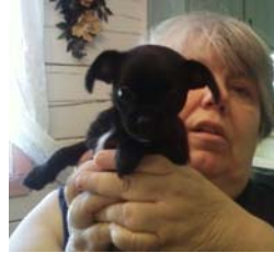
Sandra O's puppy